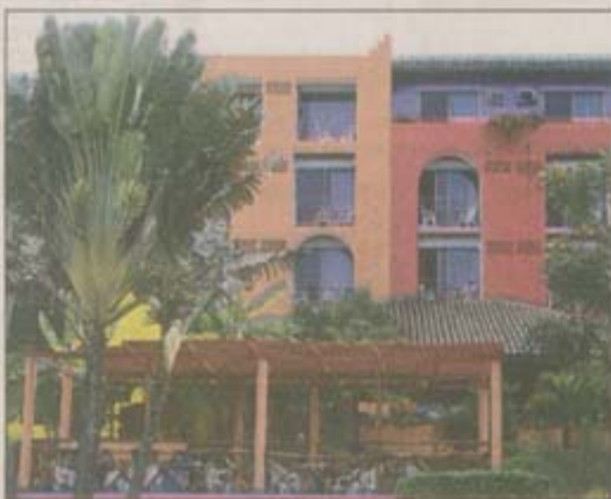
By the sea: Lodging along the Riviera Nayarit ranges from exclusive villas to all-inclusive resorts like this one in Rincón de Guayabitos.