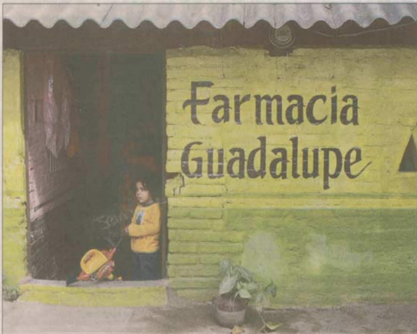
Changing landscape: A child watches the street scene from a pharmacy in a beachfront town. Before long, he may be watching celebrities stroll by.

Up and down the coast, hand-lettered for-sale signs promising privacy and views peek through the jungle foliage. In some towns, real estate sales offices masquerading as "cultural centers" lure unsuspecting